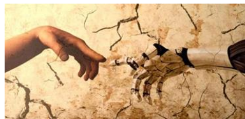
Figure 2. Image of Homo Deus(Harari, 2016)

www.google.com/search?q=homo+deus+ images&tbm=isch&tbo=u&source=univ